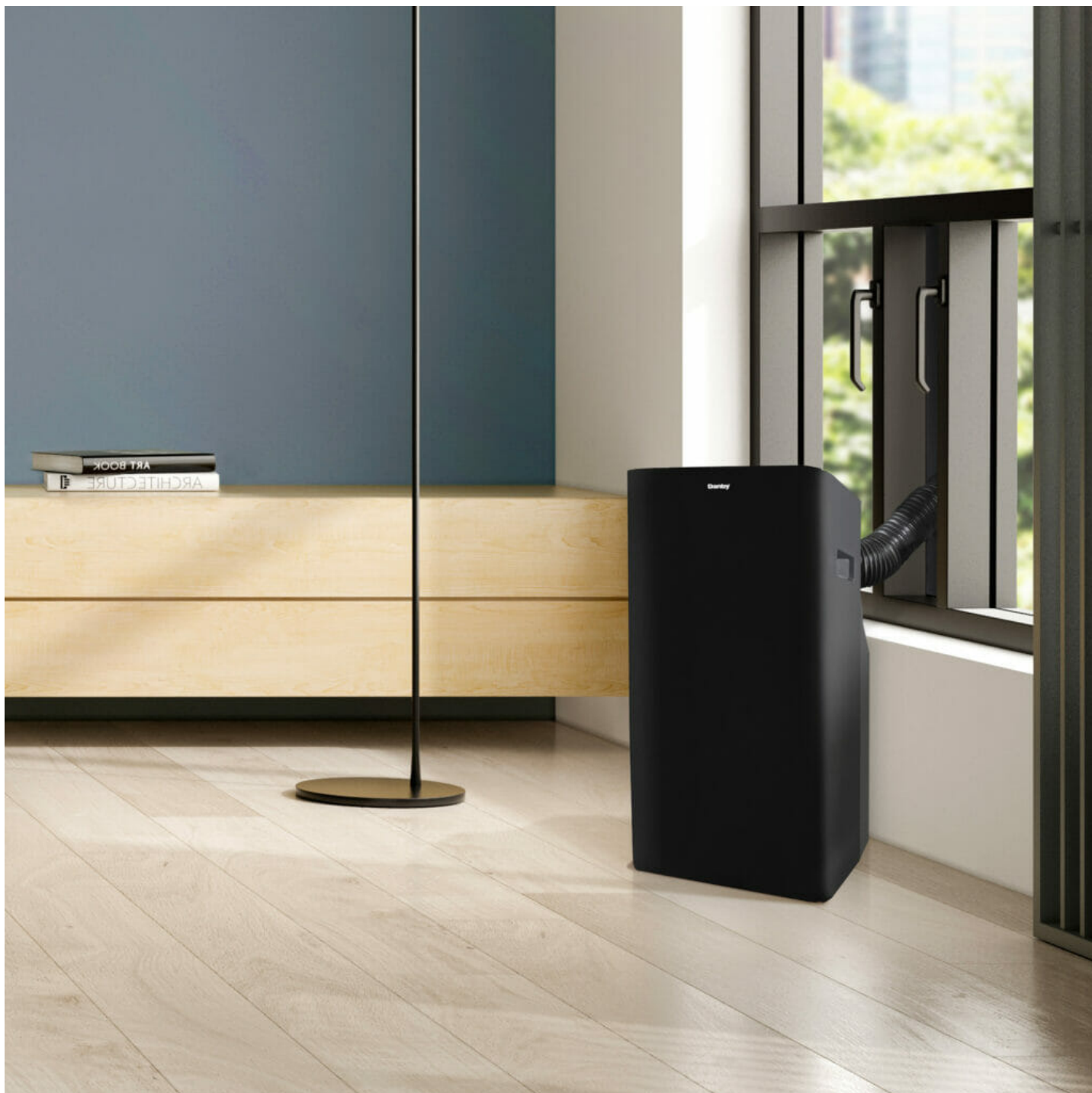
3-in-1 Design: Air Conditioner, Fan, and Dehumidifier