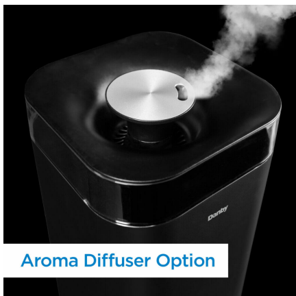
Aroma Diffuser Option