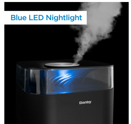
Blue LED Nightlight