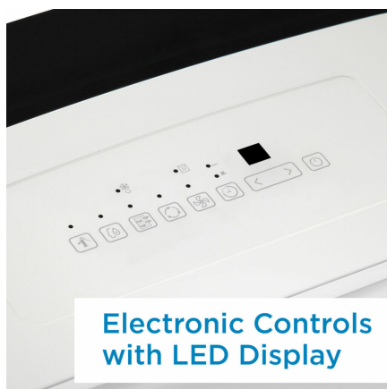
Electronic Controls with LED Display