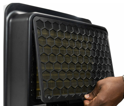
Reusable, Washable Filter