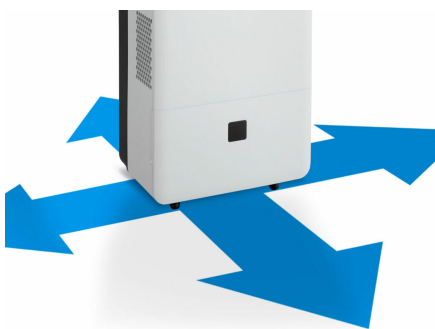
4 Castors for Easy Mobility