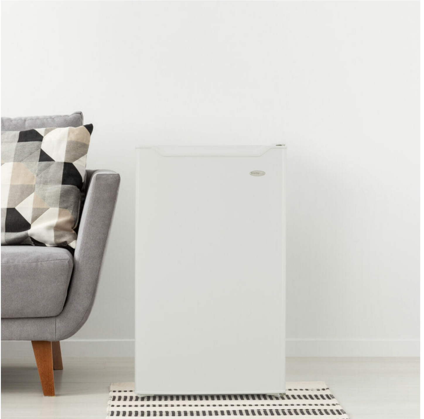
Smooth Back Design