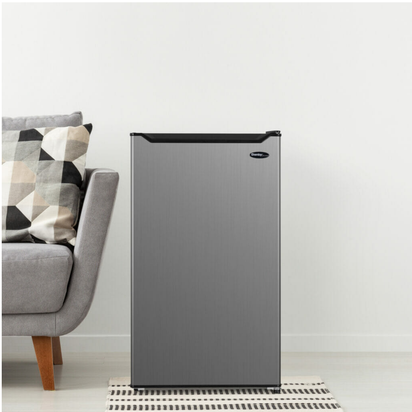
Smooth Back Design