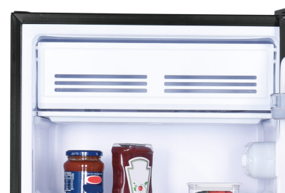
Section refroidisseur pleine largeur