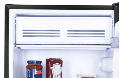
Section refroidisseur pleine largeur