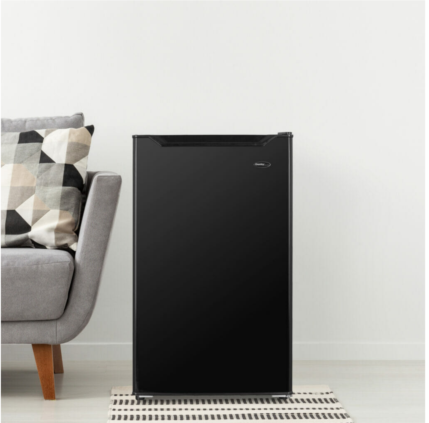
Smooth Back Design