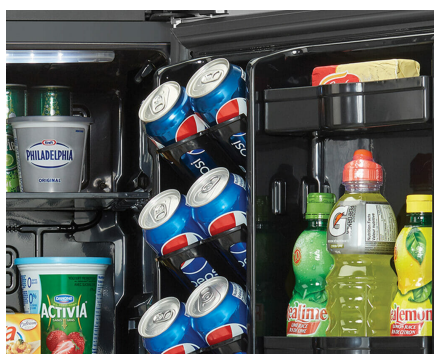
CanStor® Beverage Dispenser