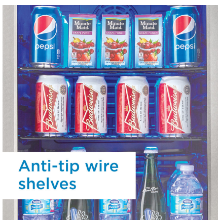
Anti-tip wire shelves