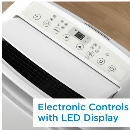
Electronic Controls with LED Display