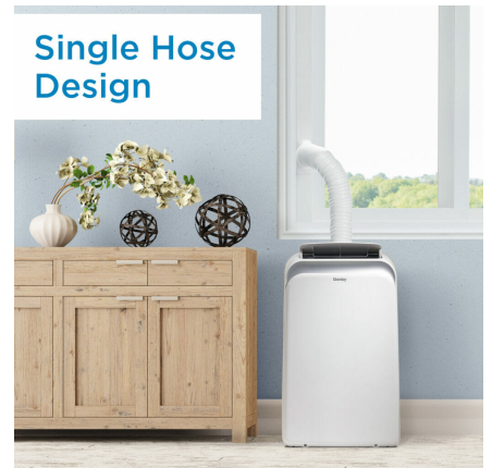
Single Hose Design