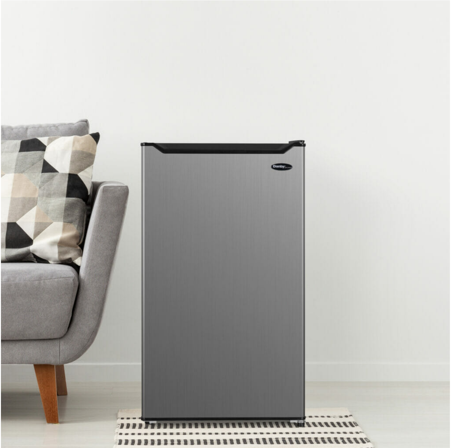
Smooth Back Design