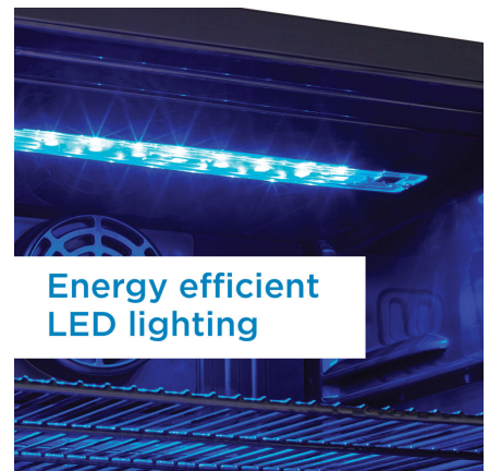
Energy efficient LED lighting