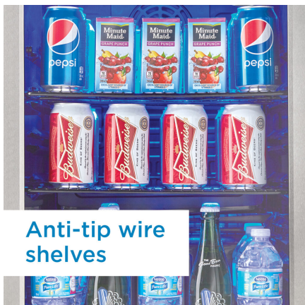
Anti-tip wire shelves