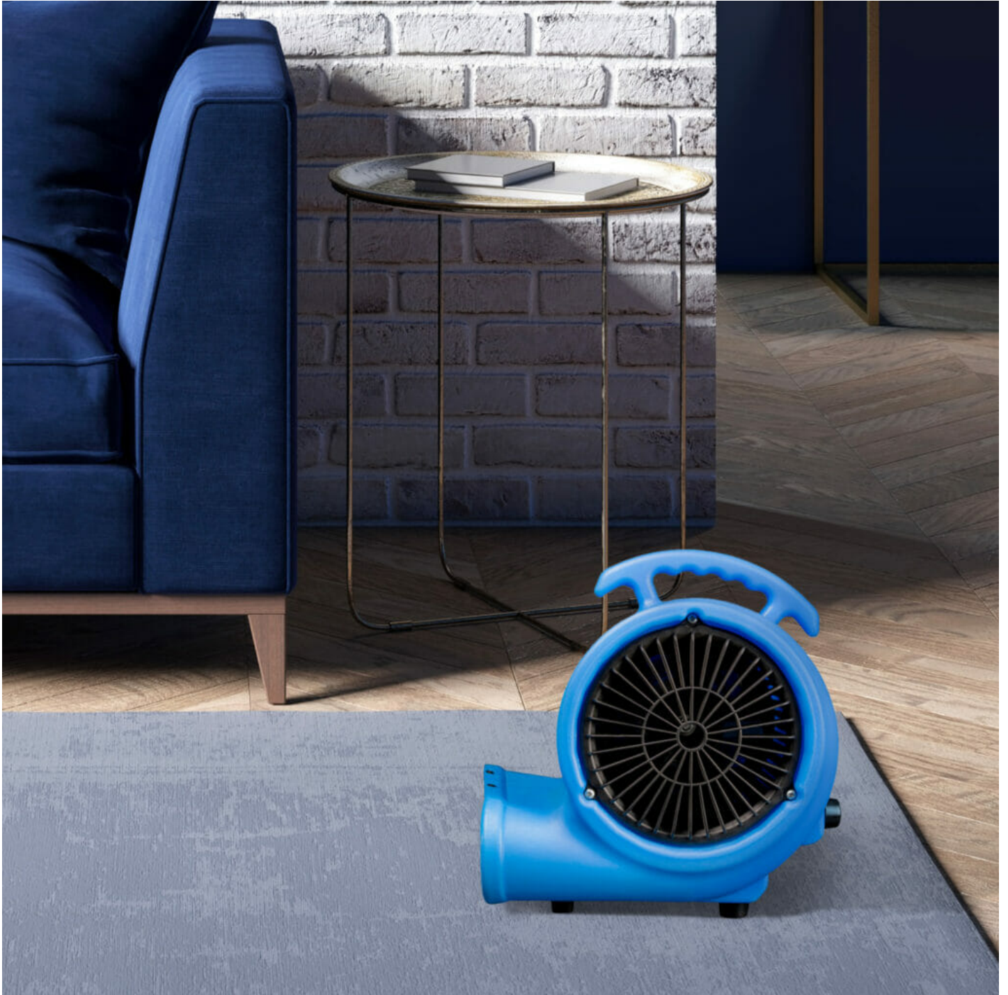
4 Drying Positions